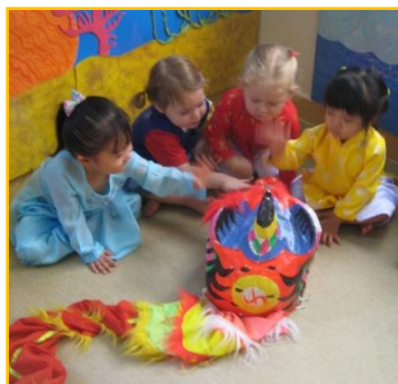
It was fun to have our own lion dance! We got to try drumming, too!