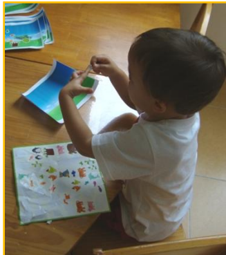
Using stickers helps us to develop the muscles in our fingers so we can learn how to manipulate objects.

Parent-teacher meetings will be the afternoons of March 10 th to 14 th ! Please see the sign up sheet outside the Yellow Room door.