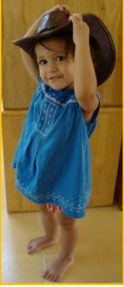
We liked playing pretend with the "real" cowboy hat and bandana.