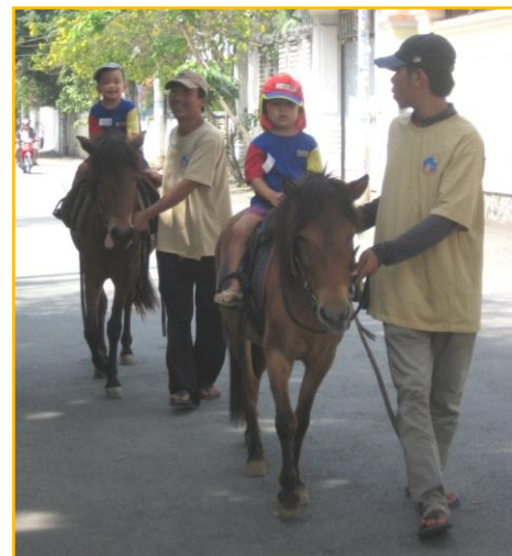
We had helpers so we didn't fall off!