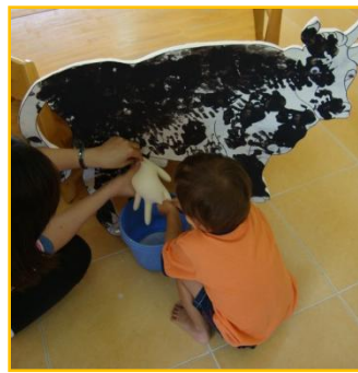
Ms. Katy made tiny holes with a needle so the milk would come out.

We followed up our theme about horses and new year with a topic about cowboys, cowgirls and cows. We made a cow for a classroom by rolling on paint. We used our hands to make black spots. We made foil belt buckles, decorated cowboy hats and took turns lassoing our cow! We also used a latex glove filled with white paint and water and tried milking our cow! It was fun to see it come out!